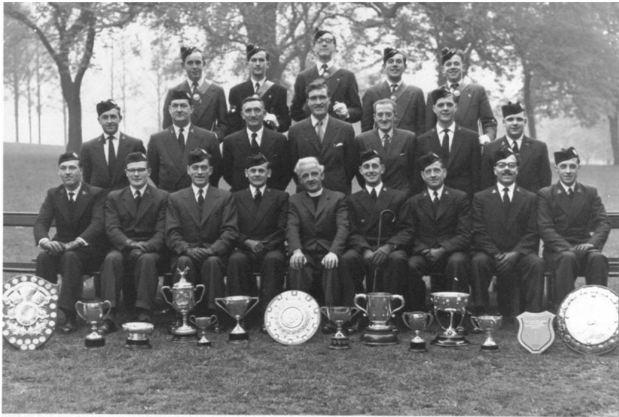
The Boys' Brigade 214th Glasgow Coy 10th May 1957